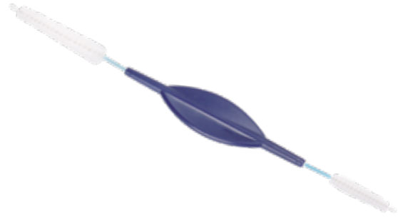
Double headed cleaning brush for air-water valve

MICRO-TECH offers the all inclusive solution for the thorough brushing of the air-water valve vents and ports. The double header brush combines a 40 mm long and 11 mm thick port brush with a 20 mm long and 5 mm thin vent brush. Both brushes are flexible and have protective distal beads to help prevent damage to the endoscope.